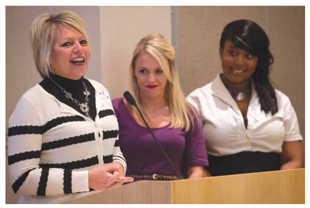
Celebration is part of service learning! NKU's student philanthropy classes gather for an end-of-semester ceremony with students and nonprofit representatives (Fall 2013).

with a relatively unique combination of data: project assessments in the short term (end of academic session) and survey results in the longer term (1 to 8 years later)."