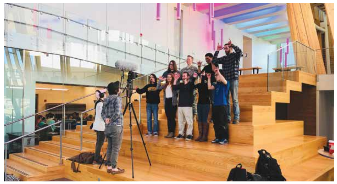
Classes find creative ways to engage around student philanthropy. This NKU class, GER 480, made a video to boost crowd-sourced fundraising (Spring 2018).

From the findings: "Experiencing proposals from the funder's perspective gives students unique insights that they can, in turn, apply as writers. The nonprofit participants in student philanthropy benefit as well. In addition to the possibility of receiving a grant, the nonprofits have the opportunity to increase awareness of their organizations' work while also making connections with many potential future supporters. Thus, student philanthropy is a multifaceted endeavor that can have a long-lasting impact on all involved, including instructors, students, nonprofits, and the constituencies they serve."