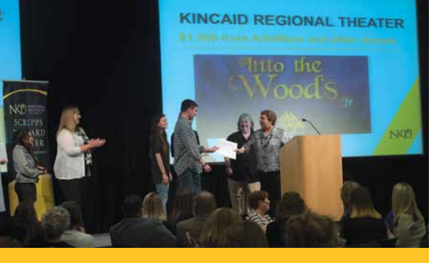
NKU hosts an end-of-the-semester celebration of all student philanthropy classes where students welcome the nonprofits they supported to the stage.