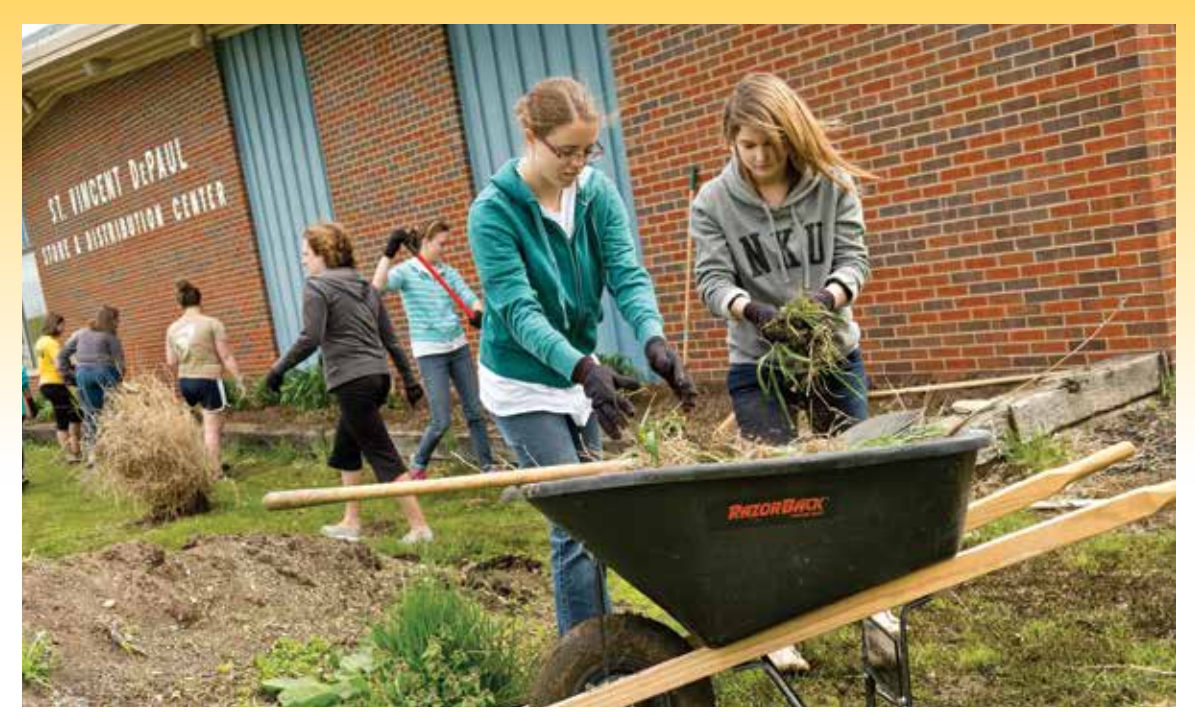
Experiential philanthropy classes teach students to be stewards of place. They become more likely to give time, talent and treasure to nonprofits.

The scholarship about student philanthropy is extensive and confirms both the stewardship benefits and the academic benefits. These seminal articles are a representative sample of the published research on this powerful, impactful way to teach.