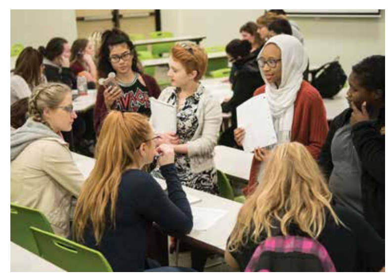
Students in SPI 481: Hispanic Women Writers discuss how to invest their funds (Spring 2018).