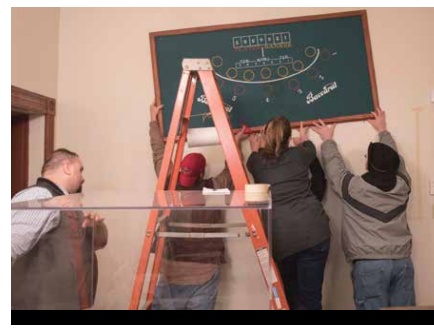
Public history students (Fall 2017) hang a 1960s baccarat table for the gambling and vice section of an exhibit for Newport's newly established history museum. Newport once was known as "Sin City" for its illegal casinos.

• A public history course designed, funded and installed the first exhibit at a new museum in Newport, a city near NKU's campus. They learned history by "doing" history.