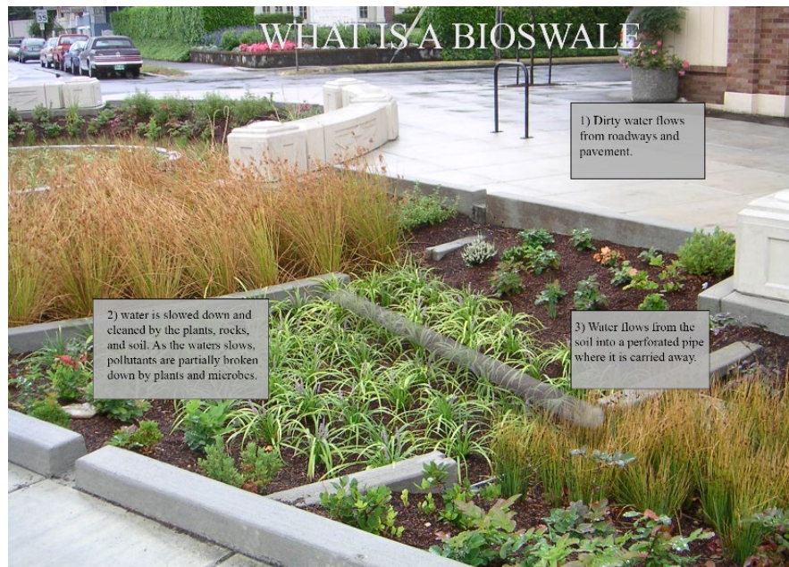
Figure 2: Infographic and Description of Bioswale

Image modified from NACTO under a Creative Commons License