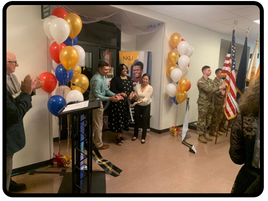
VRS ribbon cutting ceremony.

"This should potentially save our military and veteran students a semester or two of benefits and help them to graduate quicker. In addition, they will have a dedicated advisor for the minor to work with each student one-onone to finalize the minor based off their already earned credit by being in the military."