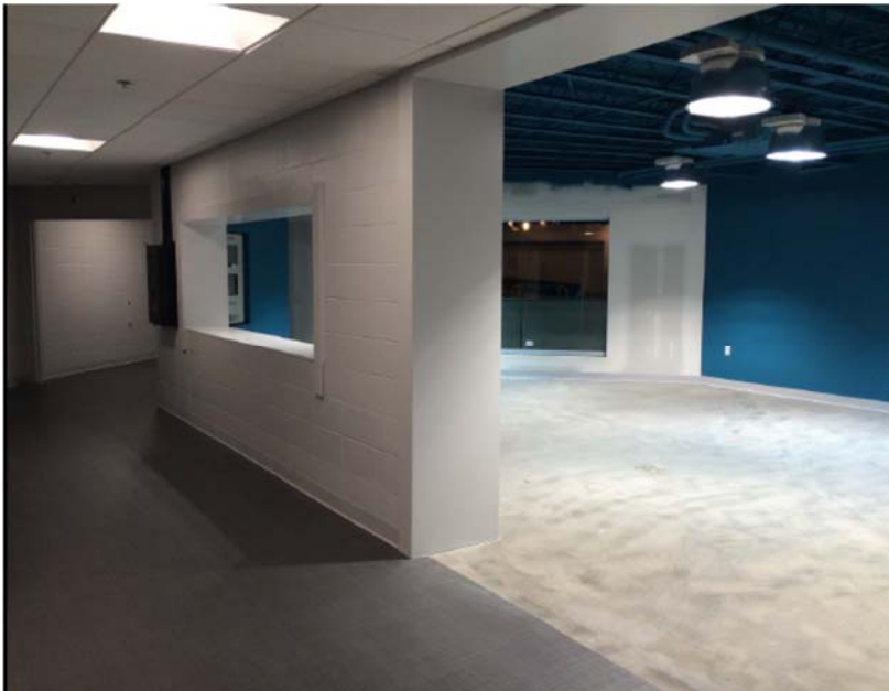
Construction Photo View of New Recreation/Reception Area