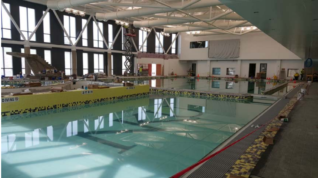
New Pool Area