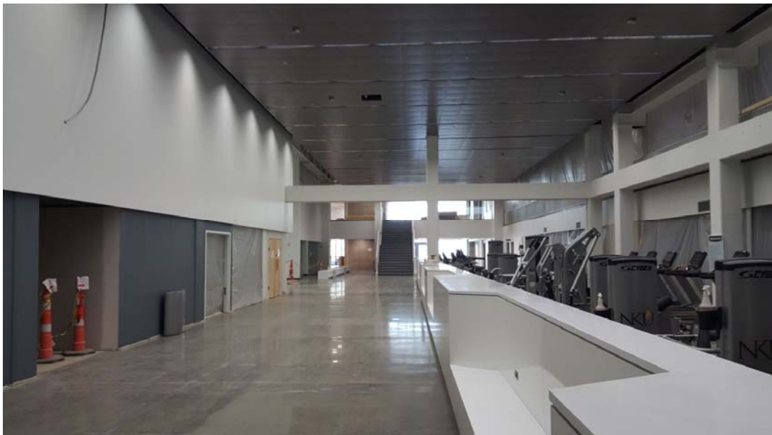
Atrium Space Looking Toward Johns Hill Road