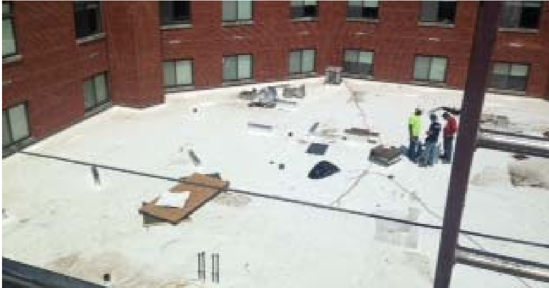
Callahan Hall Roof Projects