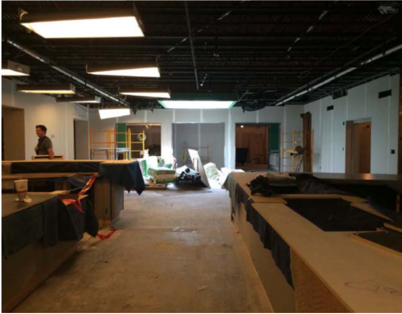
Construction Photo of Main Dining Area - View from Servery Looking South