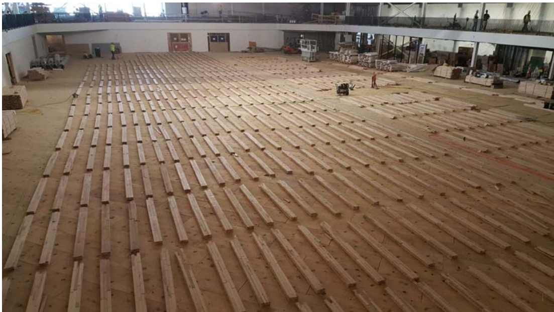
Existing Main Gymnasium Prepped for New Hardwood Floor Install