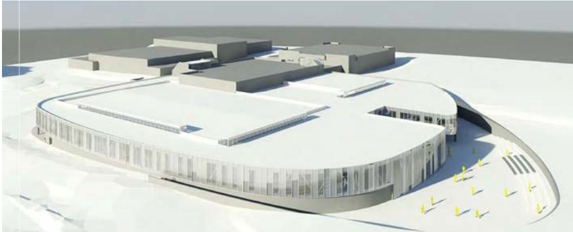
Rendering - Aerial View from Southwest of Main Building Expansion