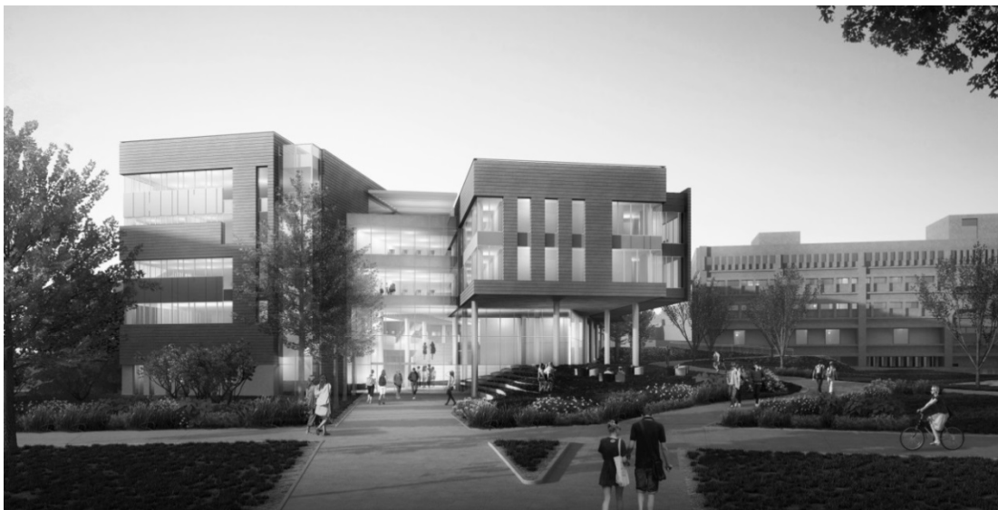
Rendering of Health Innovation Center from Kenton Drive

Scope: $2,300,000 (included in the total $97,000,000 scope)