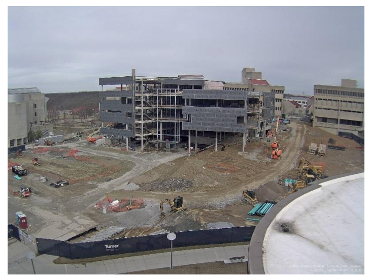
Webcam Photo of Construction Site