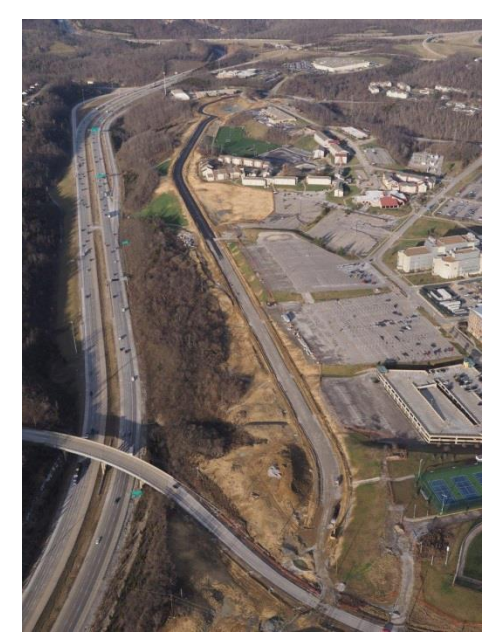
North Connector Road Photo, Dec. 2016

The University has a project in the early planning stages to redesign the parking lots along the west side of campus, between the new Connector Road and Kenton Drive. The project will include lighting and landscaping. Phase I of this project, which will encompass the reconstruction of Lot K with storm drainage, curbs, landscaping and access to the Connector Road and the Kenton Garage, is under design. Construction will begin in mid-May and be complete prior to the start of the fall semester.