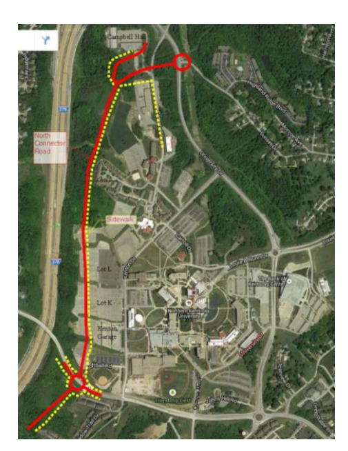
North Connector Road Satellite Image