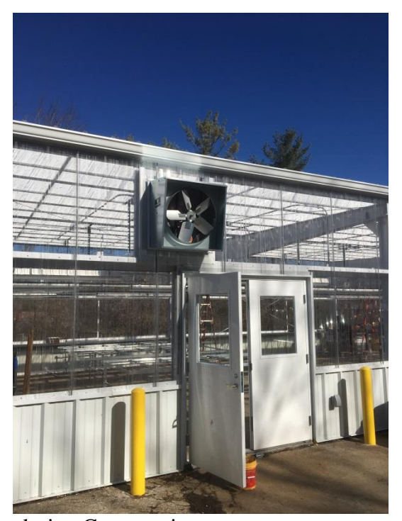
Maintenance Garage/Greenhouse Conversion during Construction