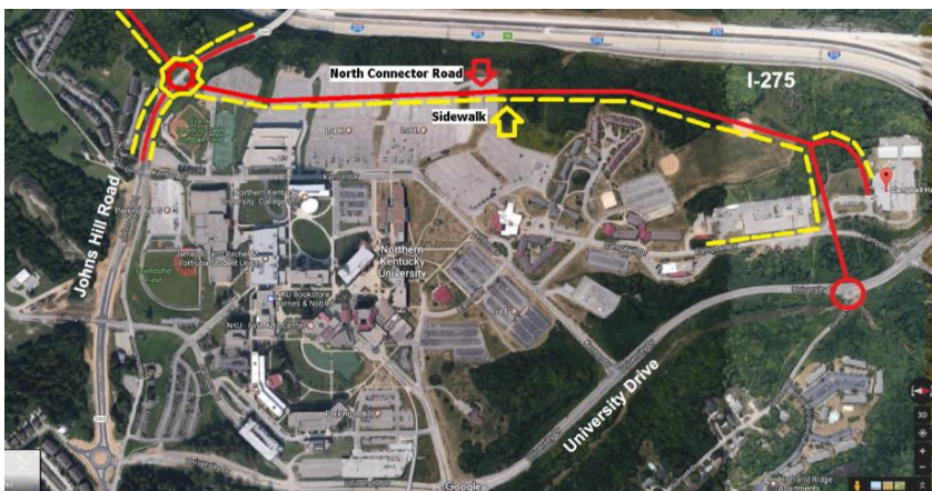
Satellite Image Norse Boulevard