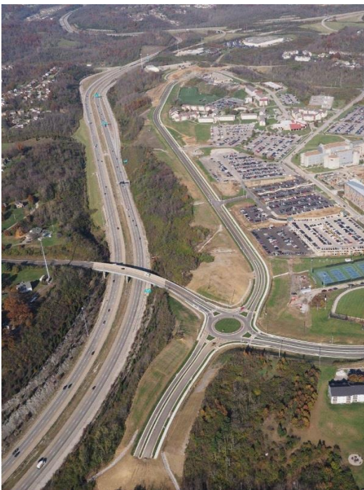
Norse Boulevard Aerial Photo, November 2017

A south section of Norse Boulevard, which is to be built later, will extend south of Johns Hill Road over a mile, connecting with Pooles Creek Road near its intersection with AA Highway. Norse Boulevard was a high priority of both the 2000 and 2009 Master Plans and upon completion, will resolve traffic congestion in the core area of campus.