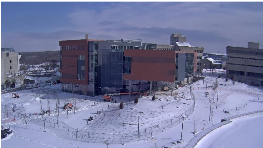
Webcam Photo of Construction Site, February, 2018