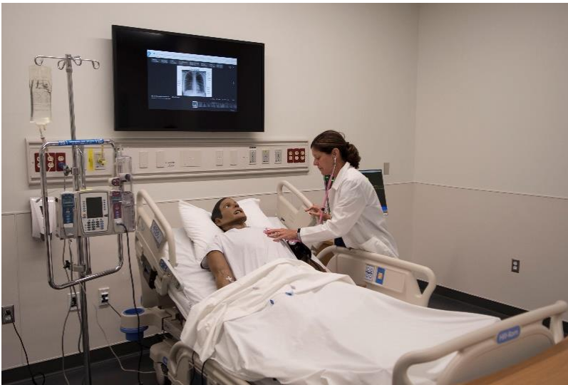
HIC – Simulation Lab