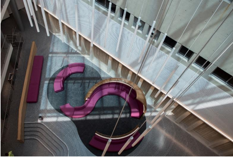
HIC – Looking Down into Atrium