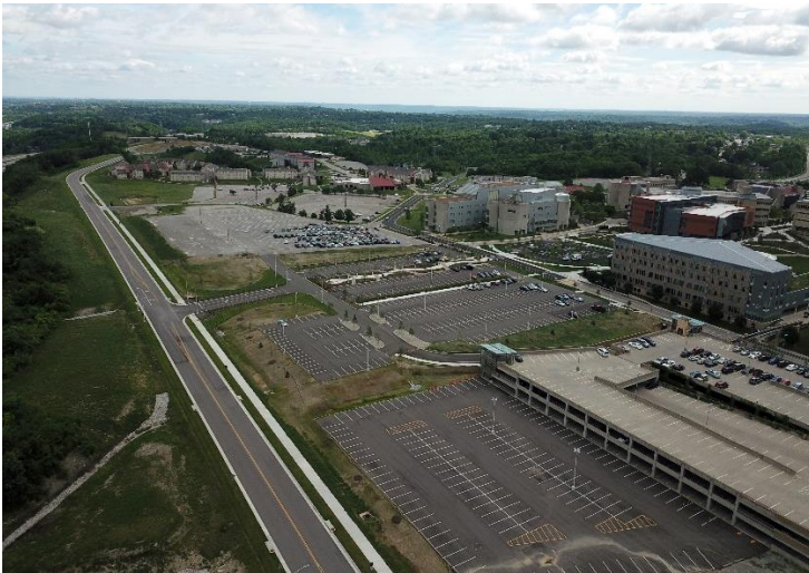
Norse Boulevard Looking North

A south section of Norse Boulevard, which is to be built later, will extend south of Johns Hill Road over a mile, connecting with Pooles Creek Road near its intersection with AA Highway. Norse Boulevard was a high priority of both the 2000 and 2009 Master Plans and upon completion, will resolve traffic congestion in the core area of campus.