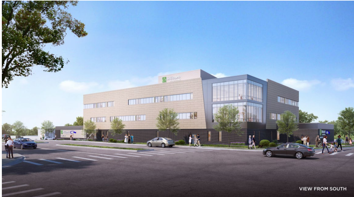
St. Elizabeth Medical Office Building, October 16, 2018 Rendering, View from Nunn Drive