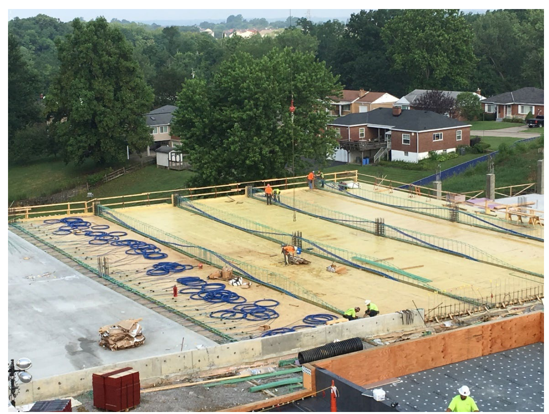
Garage Construction on Phase I Site as of July 19, 2019