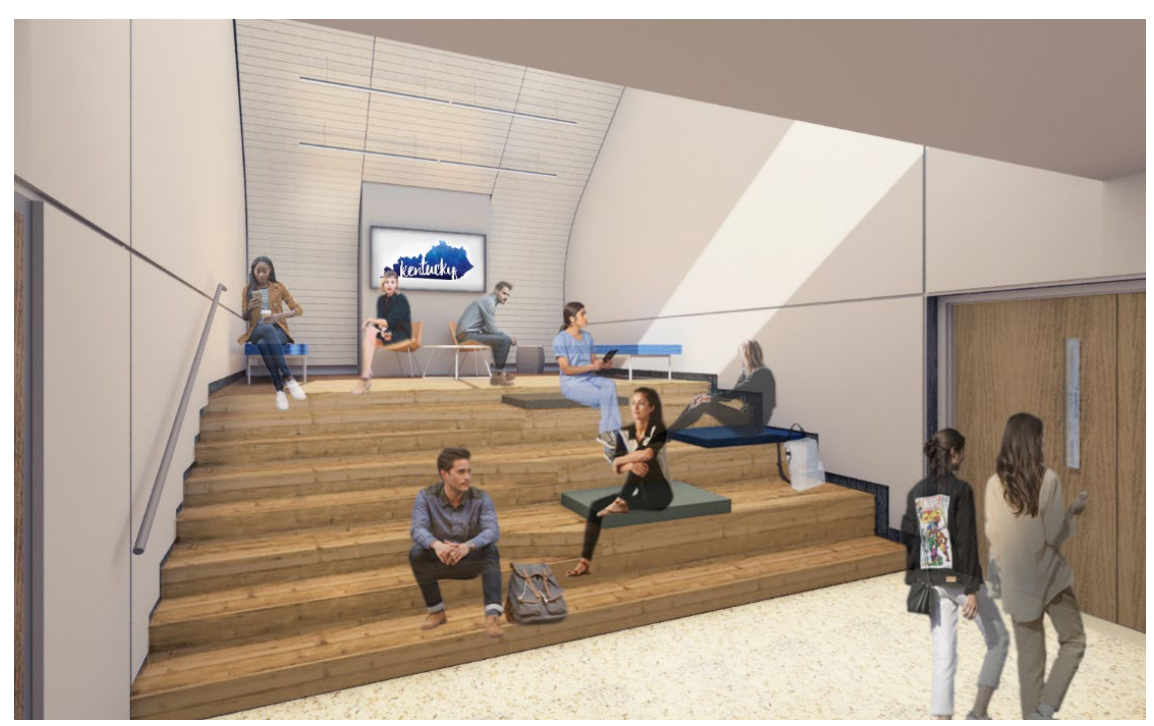
Student Social Stairs Rendering, UK College of Medicine-Northern Kentucky Campus NKU Albright Health Center, 3<sup>rd</sup> Floor

<u>Fund Source</u>: University of Kentucky <u>Anticipated Completion</u>: Spring 2019