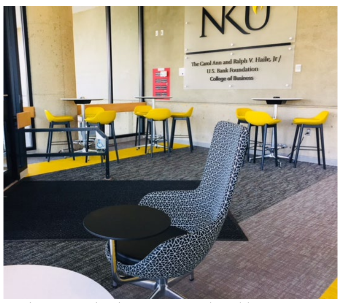
Business Academic Center North Lobby