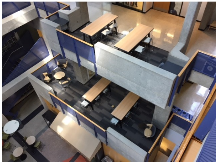
Herrmann Science Center Atrium