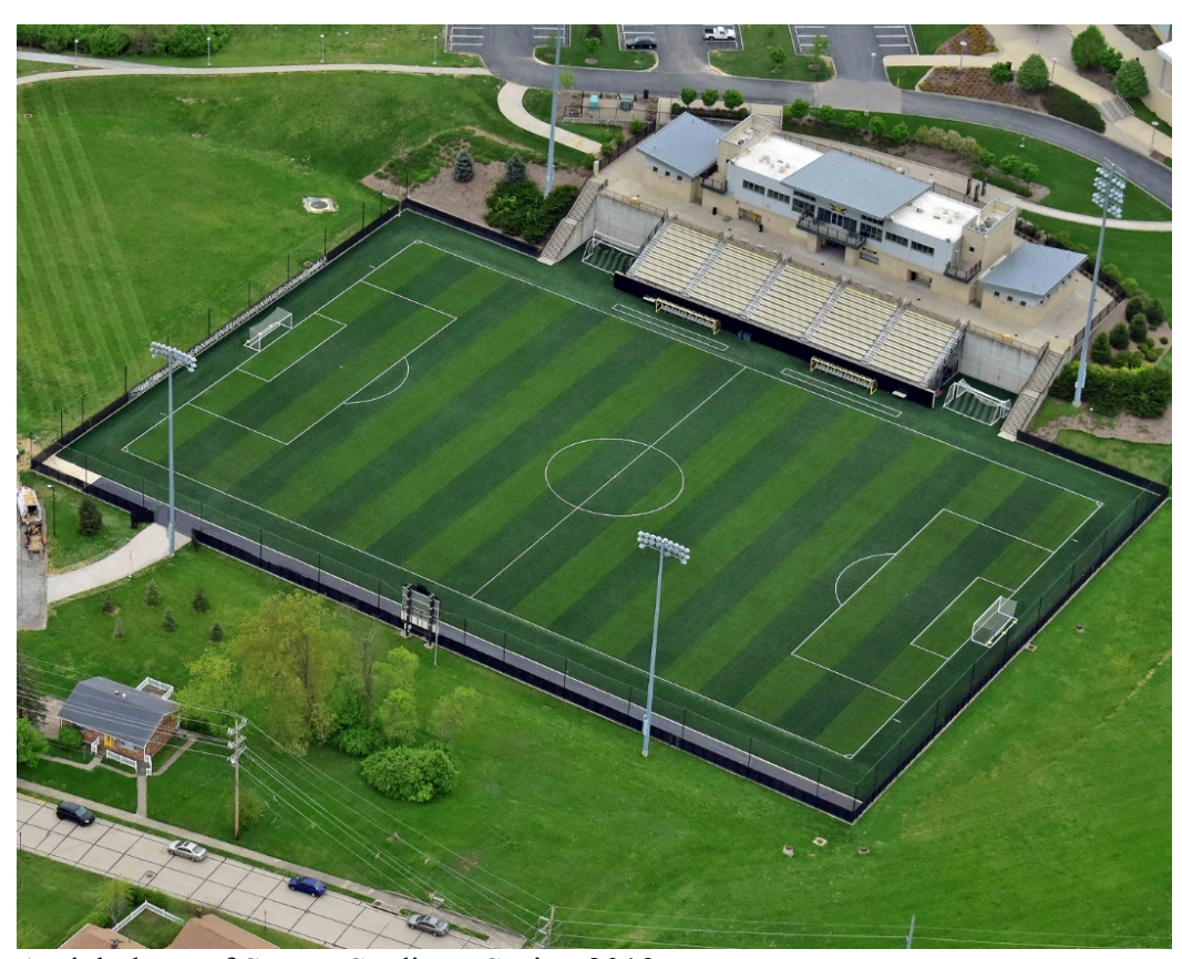
Aerial photo of Soccer Stadium, Spring 2019