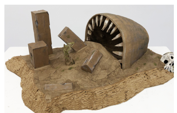
by: Peyton Oka