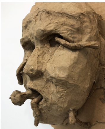
by: McKenna Brennen

You can see these amazing creations in person at the Ceramics/Sculpture building Mon - Fri from 9:00 am - 4:30 p.m.