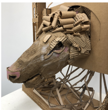
by: Grady Gartland