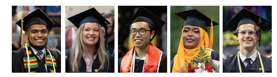
opportunity institution. MC230272

Tickets are not required for guests or graduates, and there is no limit on the number of guests who may attend. Guest seating will be on a first-come, first-