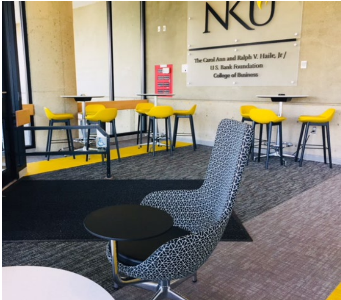
Business Academic Center North Lobby