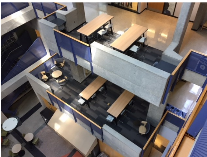
Herrmann Science Center Atrium