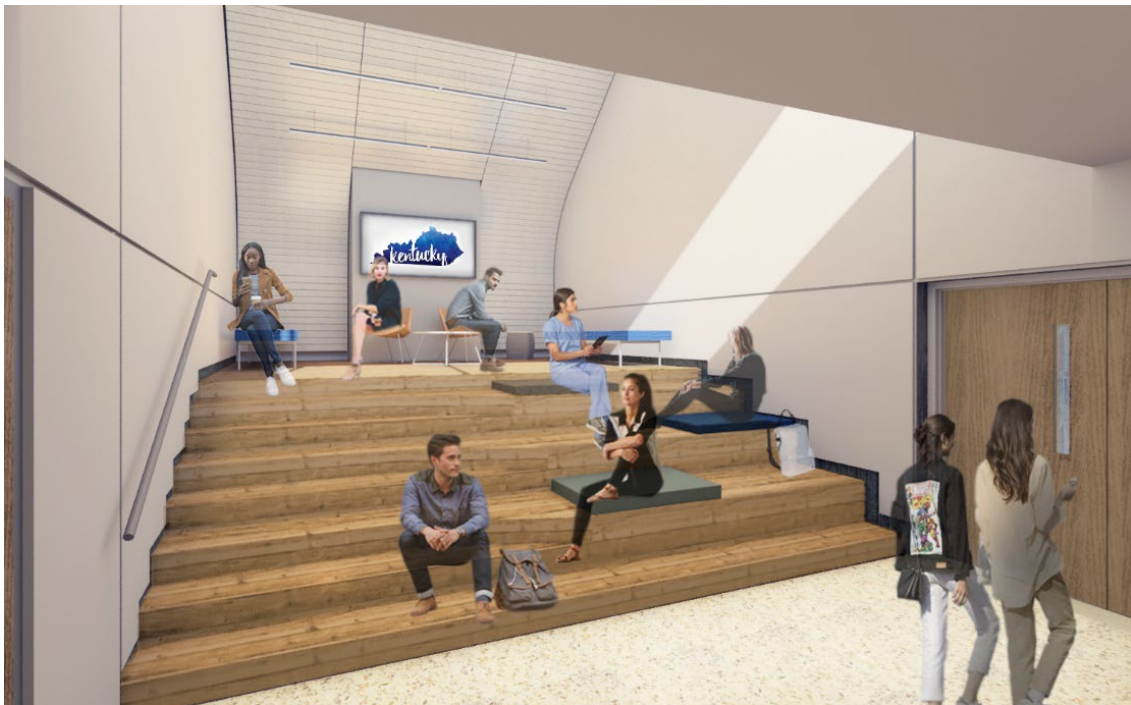
Student Social Stairs Rendering, UK College of Medicine-Northern Kentucky Campus NKU Albright Health Center, 3 rd Floor