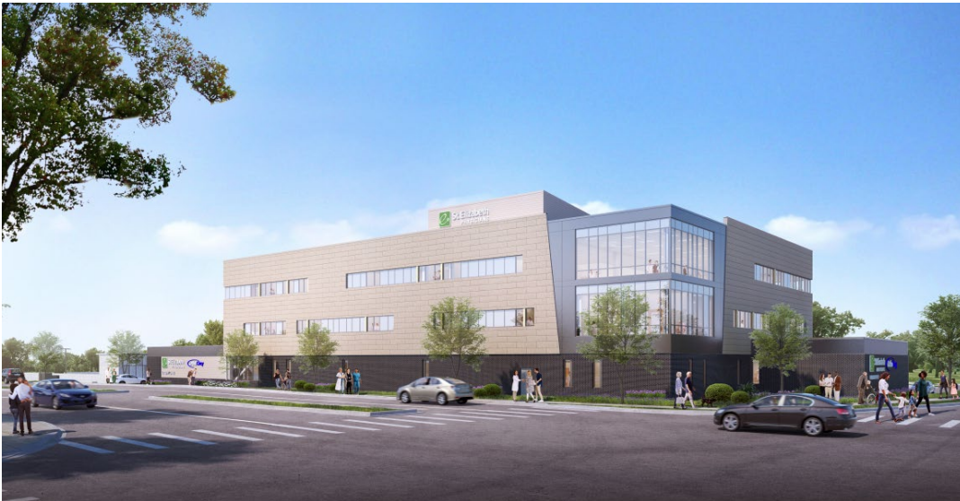
St. Elizabeth Medical Office Building Rendering, View from US 27 and Nunn Drive