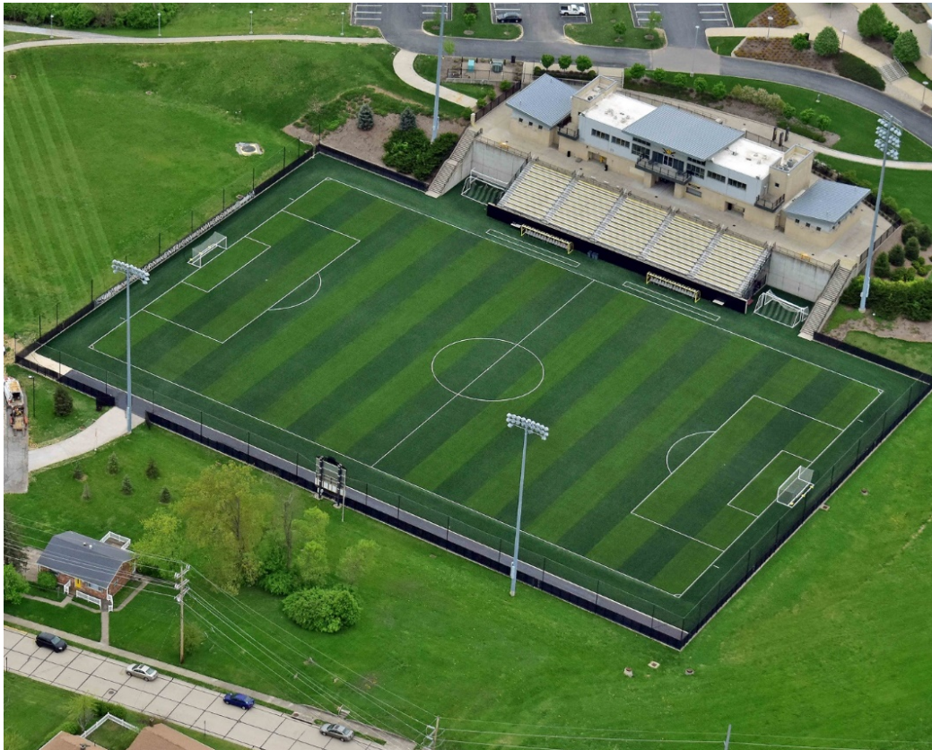
Aerial photo of Soccer Stadium, Spring 2019