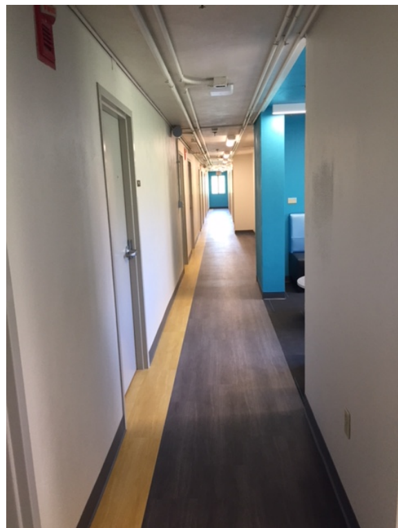
Commonwealth Hall – a River lounge and a River corridor