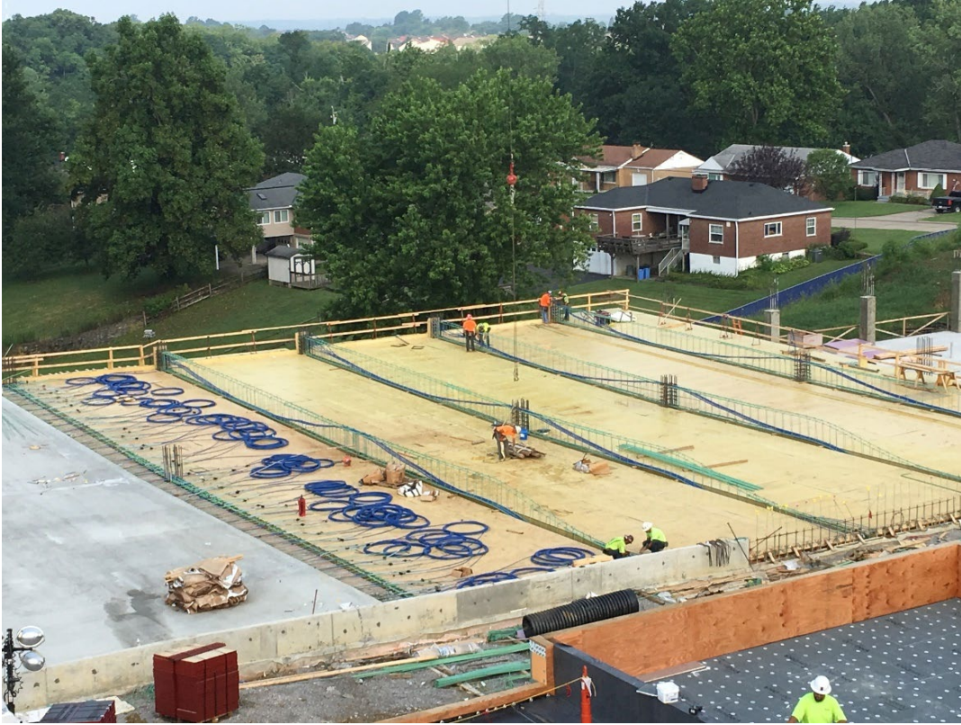
Garage Construction on Phase I Site as of July 19, 2019