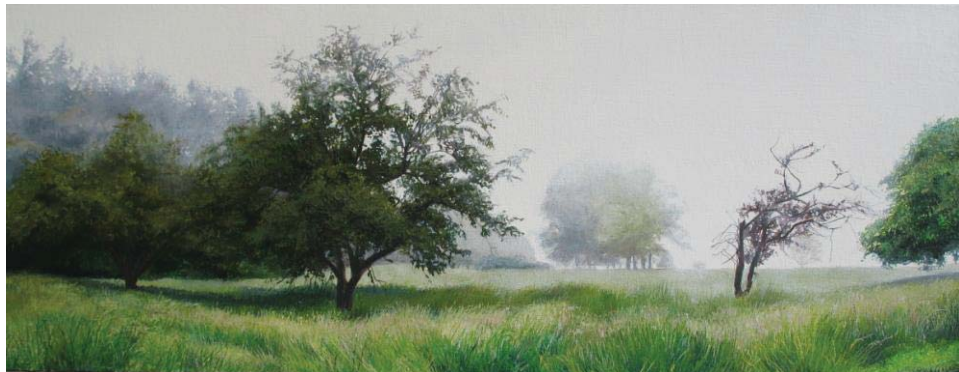
May, from the Yearbook series, oil on canvas, 12 x 30.5 inches

At present I have a few series that I've been working on. Seasonal Landscapes, National Parks, and Figurative Narrative Landscapes I've been able to make some small on-site studies and have amassed a large collection of photographic references, but I require an extended period of time to make large, studio paintings.