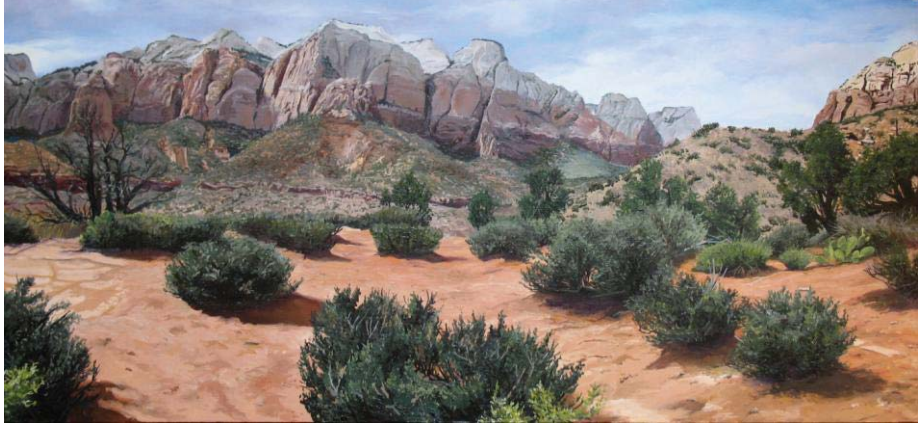
From the Watchman, Zion National Park , oil on board, 10.5 x 23.5 inches The Figurative Narrative Landscapes series I started about two years ago is a body of work that I've had much success with and hope to continue. For the past two years, my desire to

The National Parks series has been on hold for the past two years as I've been working with the figure in the landscape. Several years ago I was artist in residence at Denali National Park in Alaska, and Rocky Mountain National Park in Colorado. I've painted in many of the country's National Parks and hope to someday self publish a catalog of my paintings of these locations. This project which I haven't been able to work on for the past couple of years is again ready. I have ideas and photo references that I've taken for Acadia, Everglades, Grand Tetons, Bryce Canyon, Grand Canyon and Glacier, as well as five National Parks in Canada.