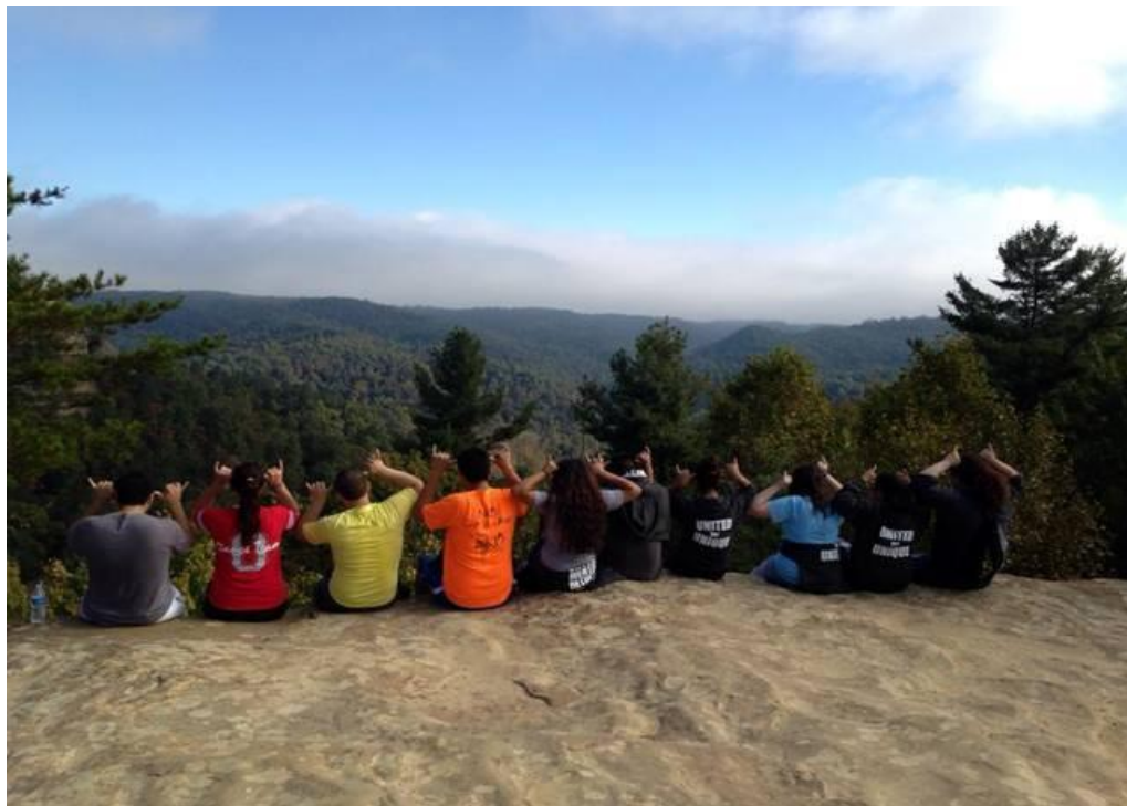
THE LATINO MENTOR PROGRAM FALL RETREAT