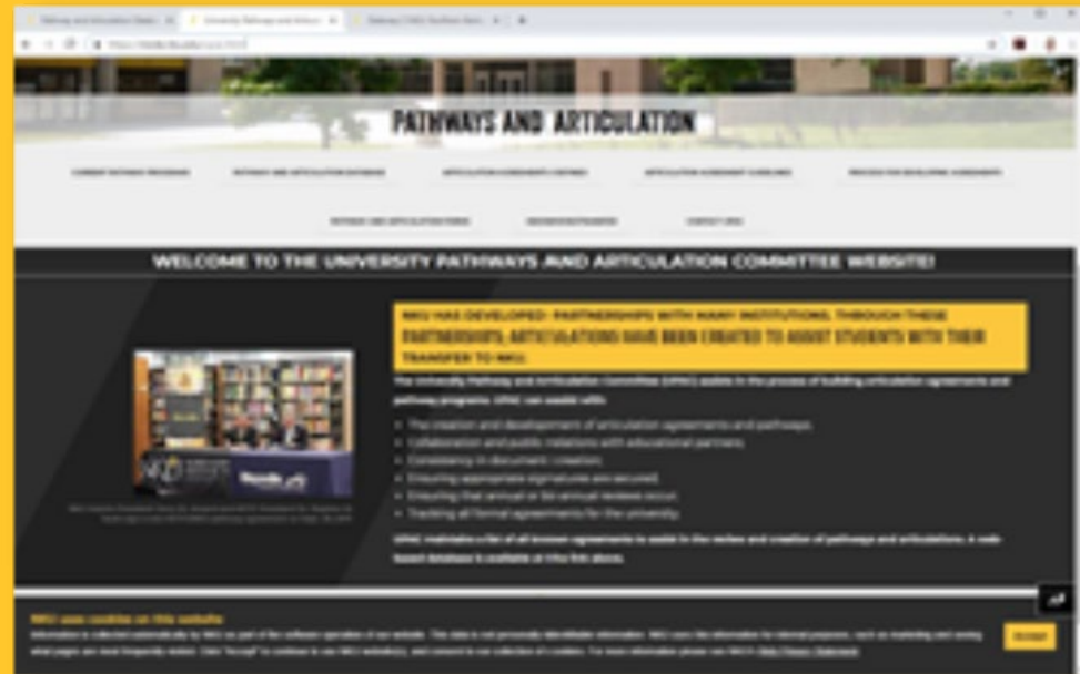
01 UPAC Website