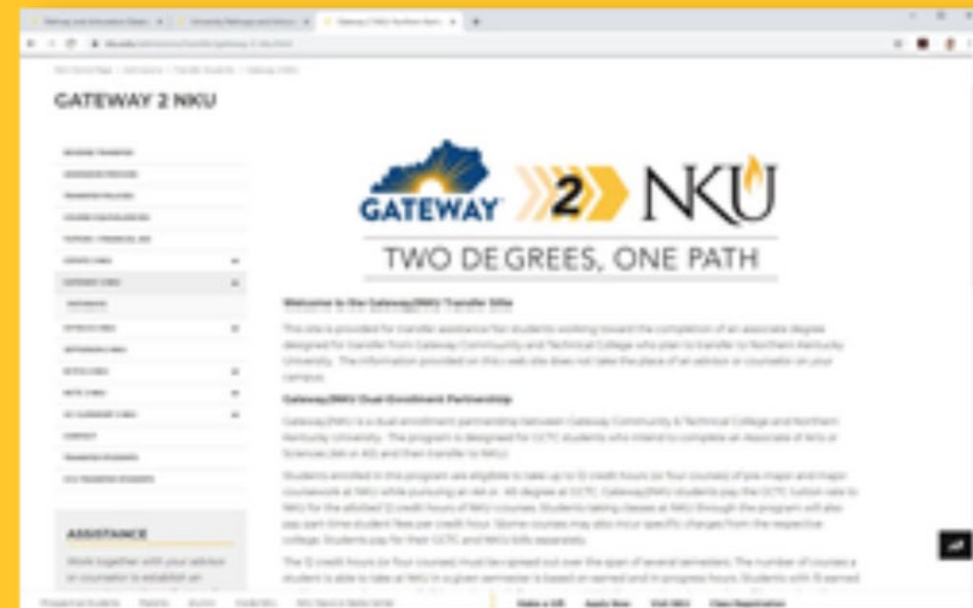
03 program web pages