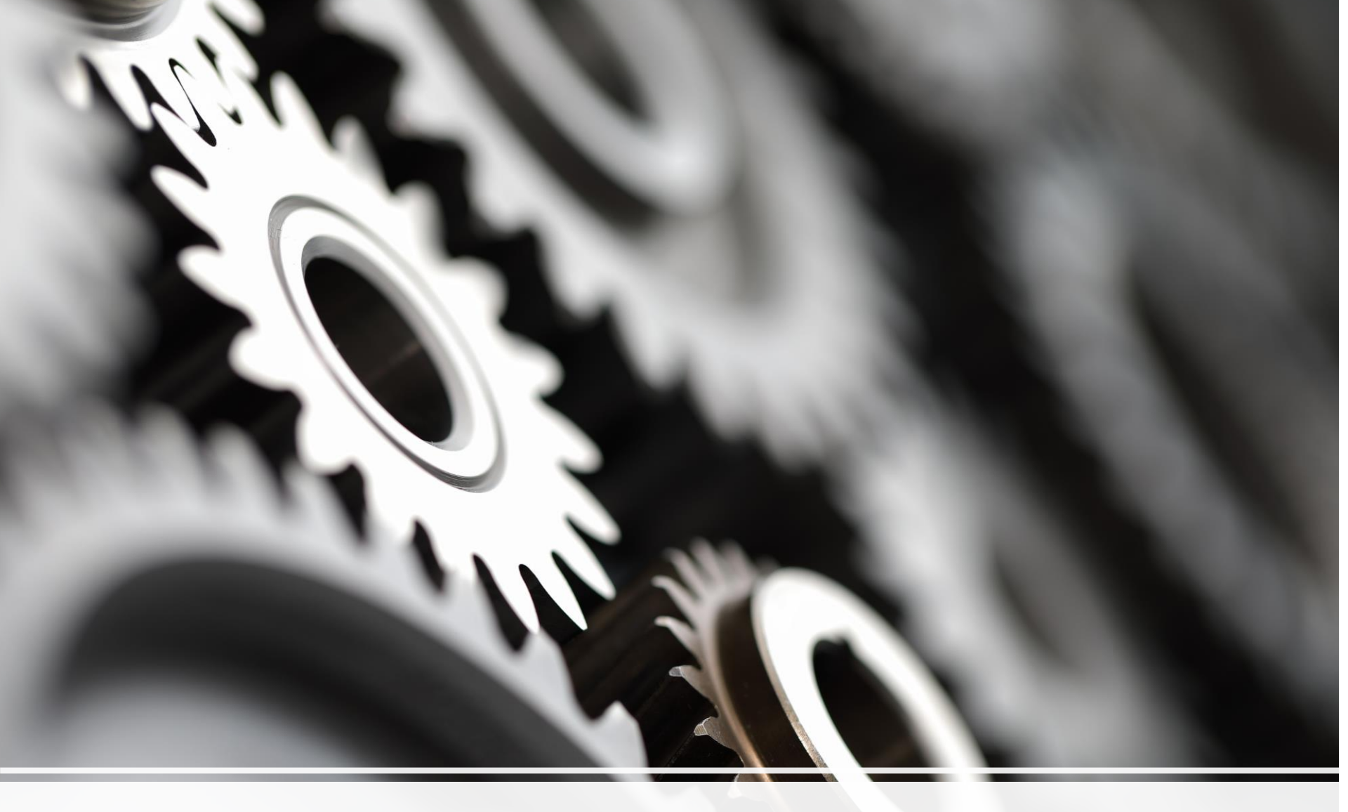
Responsible Conduct of Research Training