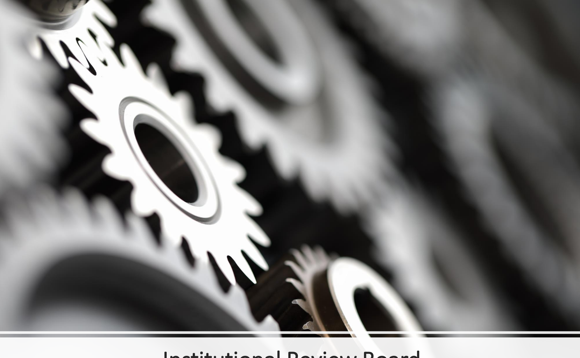
Institutional Review Board