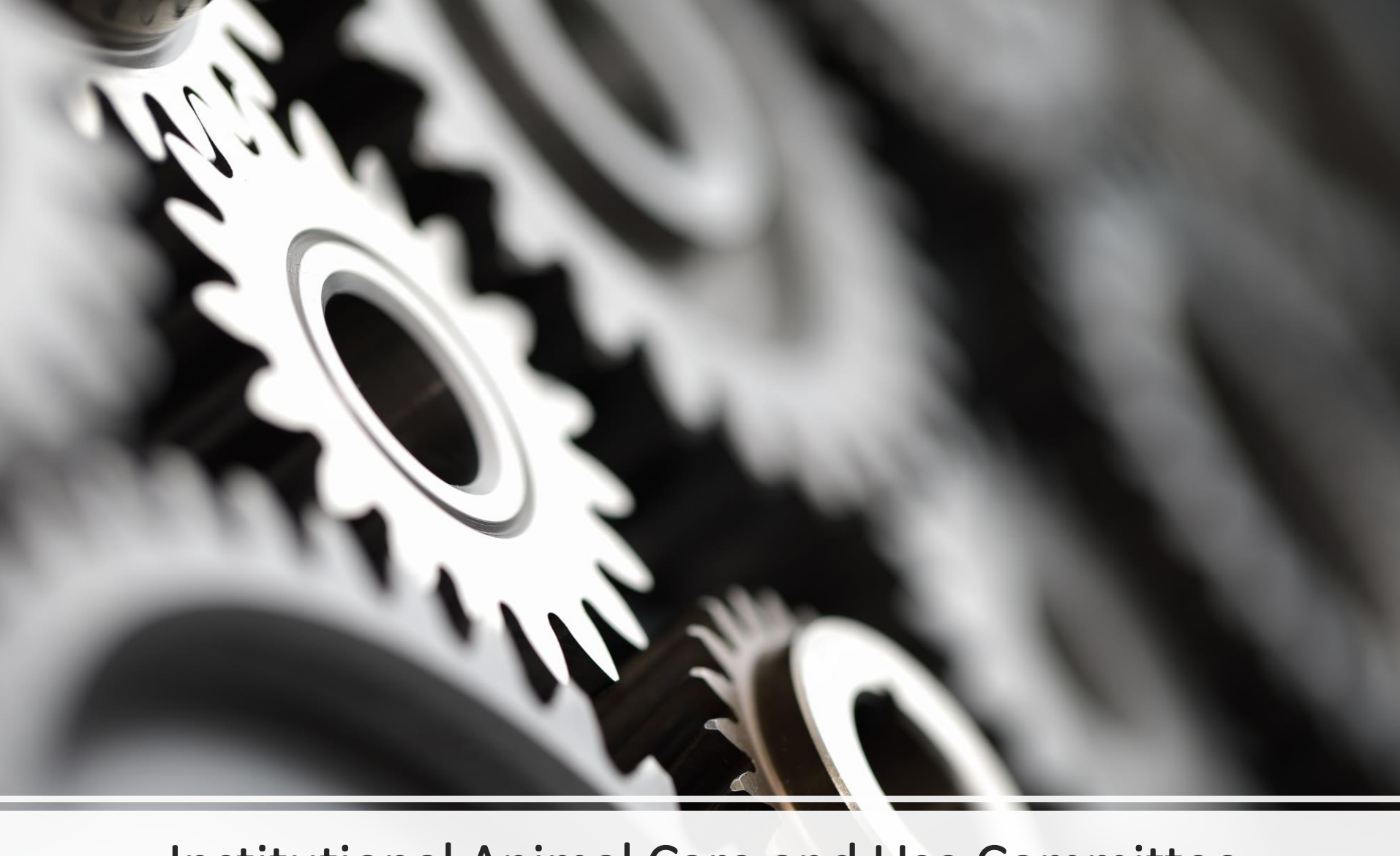
Institutional Animal Care and Use Committee