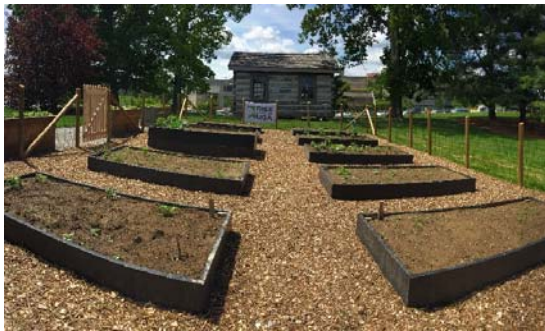
Community garden network