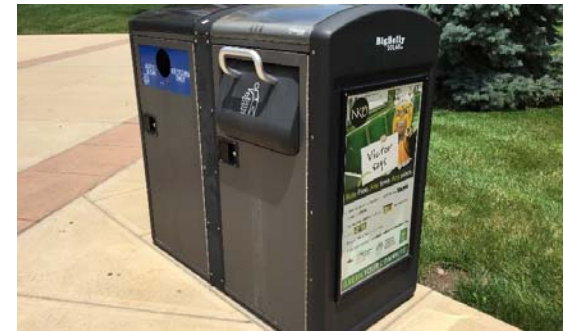
Track changes and evaluate best practices