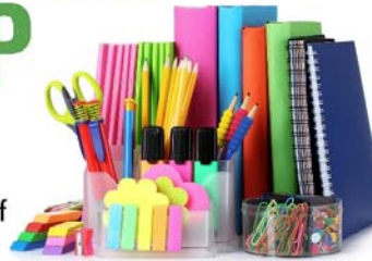
Biannual Office Supply Swaps

Friday, August 5 SU 104 11 a.m. - 1 p.m. All faculty and staff welcome!