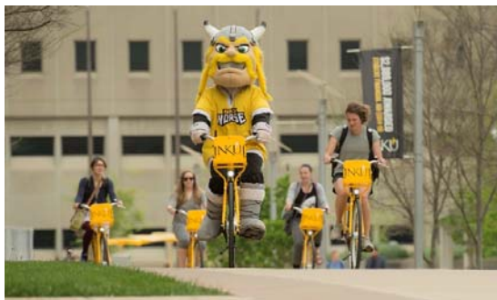
Alternative Transportation Celebration