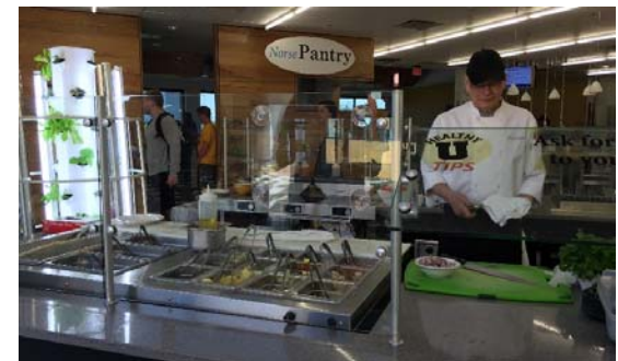
Tower Garden demo