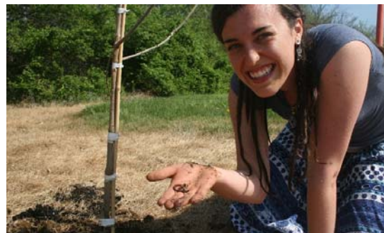
Community garden grand opening & native tree planting