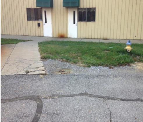
Distressed area behind Campbell Hall.