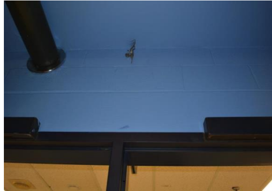
Wires hanging from the ceiling.