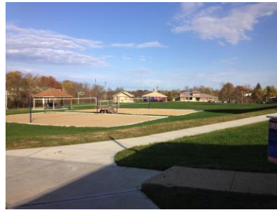
No lighting at volleyball courts behind Callahan Hall.