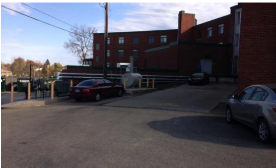
Students parking at the docks behind Callahan Hall.