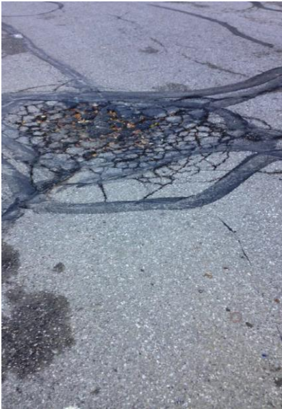
Pothole between Kentucky and Commonwealth Hall.