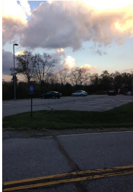
Area outside Ceramics building where call box could go.