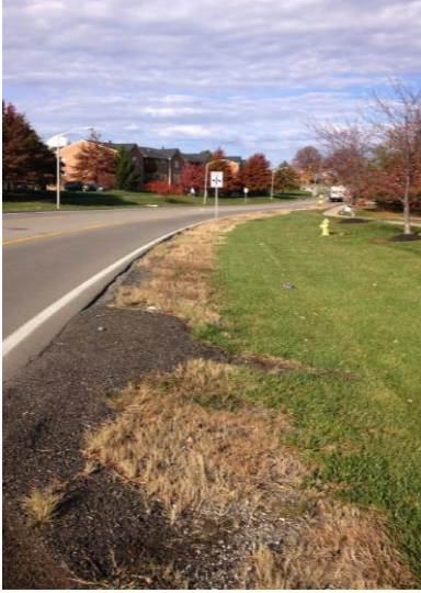
No lighting on popular path between MLC Boulevard and main campus.