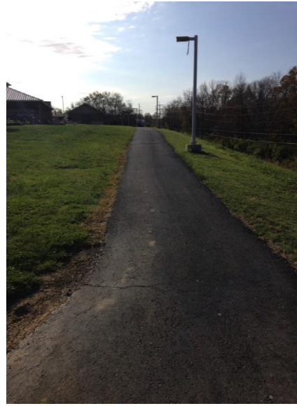
Lack of call box on path between Callahan Hall and Soccer Fields.