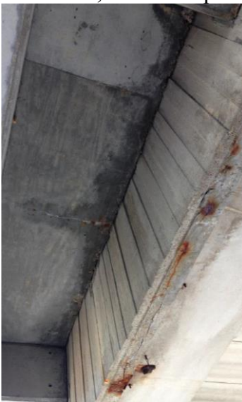
Corroded, somewhat leaky concrete under MEP/LAC/UC bridge to Main Campus.