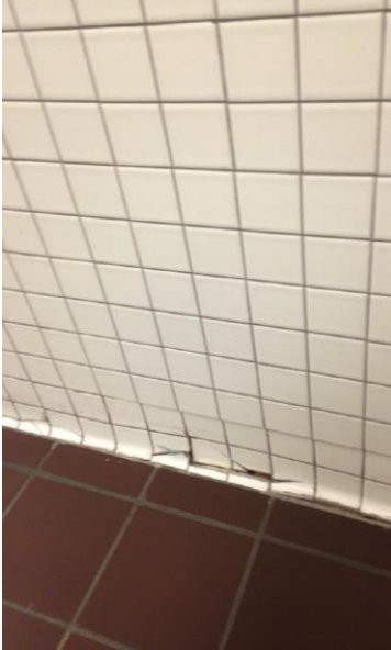
Cracked tiling, fifth floor Women's restroom in Founders.