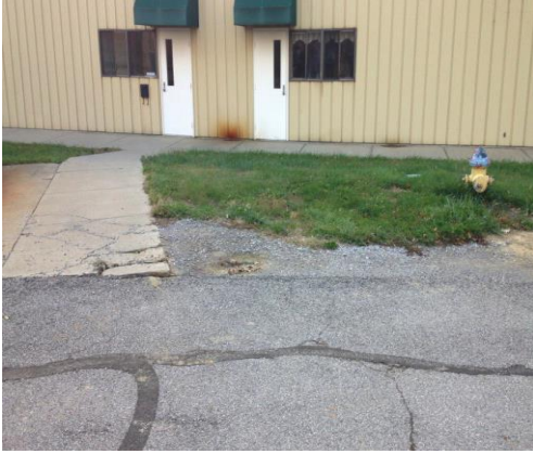
Distressed area behind Campbell Hall.