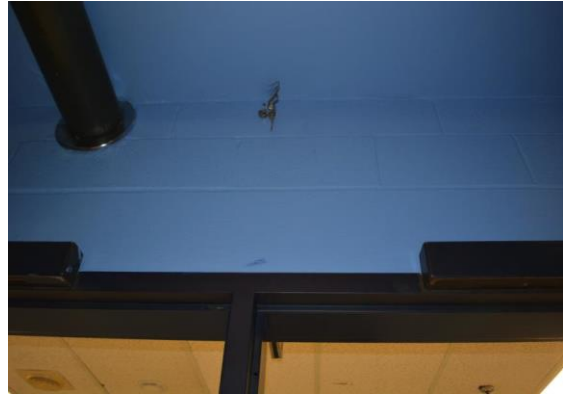
Wires hanging from the ceiling.