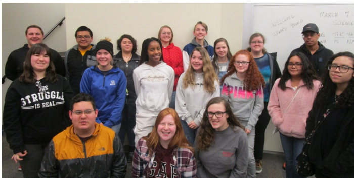
ALL "A" HONOR ROLL

FIRST SEMESTER HONOR ROLL: We're very proud of all our participants and were amazed at how many earned spots on the Honor Roll for the first semester. Here are pictures of many of them receiving gift cards for their hard work at the February meeting.