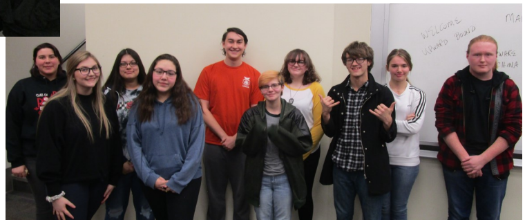
All "A/B" HONOR ROLL