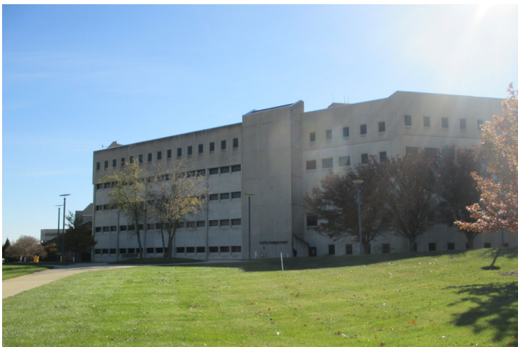
Landrum Academic Center where we will meet on Saturday, December 11th.